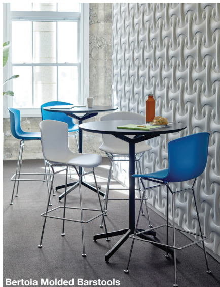
Bertoia Molded Barstools