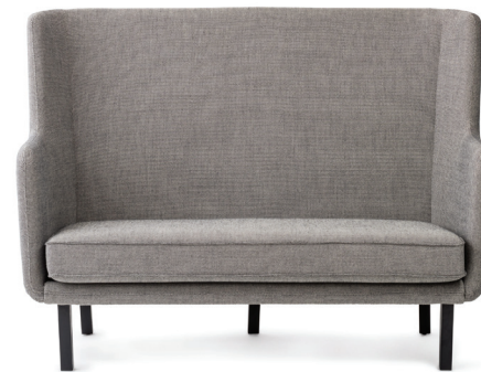
Rockwell Unscripted Highback 2-Seater