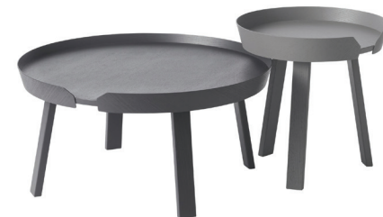
Muuto Around Tables