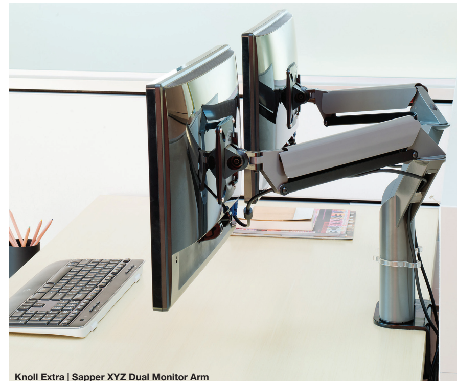
Knoll Extra | Sapper XYZ Dual Monitor Arm