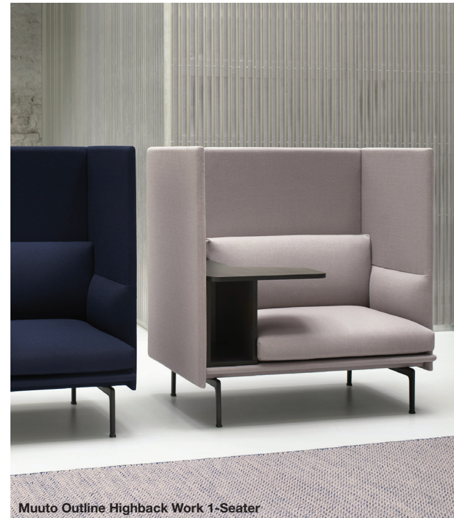
Muuto Outline Highback Work 1-Seater