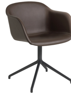
Muuto Fiber Arm Chair