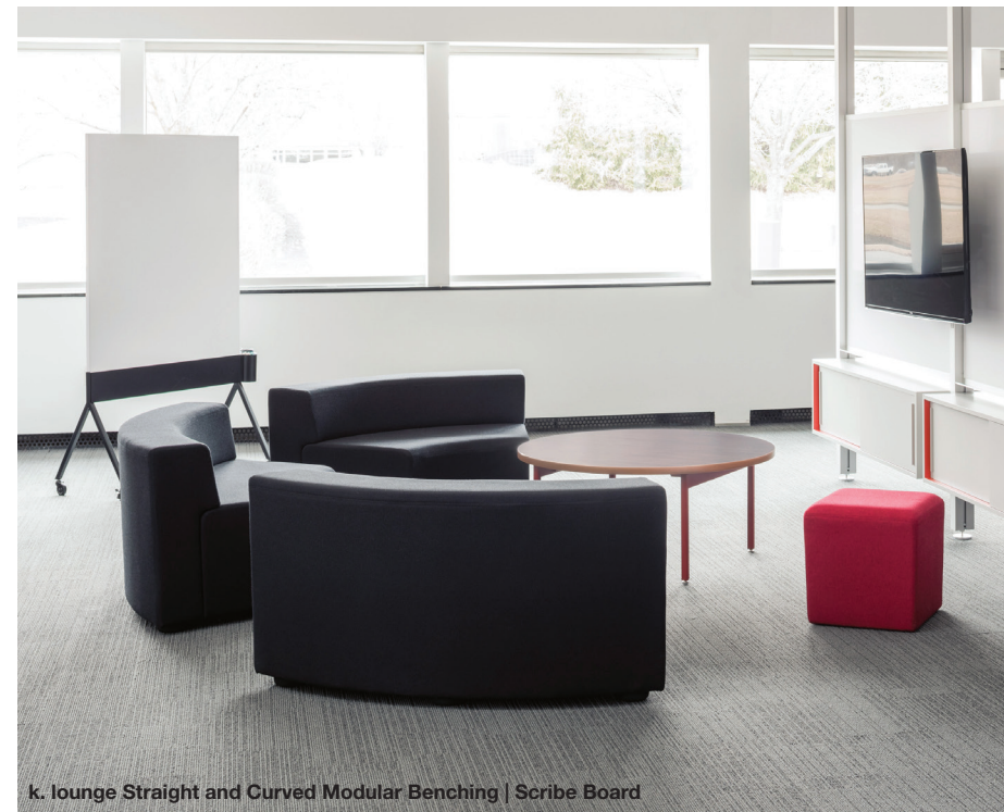
k. lounge Straight and Curved Modular Benching | Scribe Board