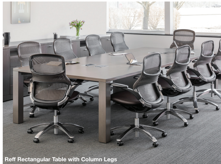
Reff Rectangular Table with Column Legs