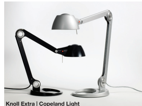
Knoll Extra | Copeland Light