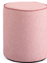
Rockwell Unscripted Upholstered Seat