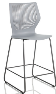
Multigeneration Bar Stool