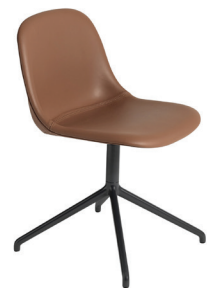
Muuto Fiber Side Chairs