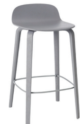
Muuto Visu Barstool