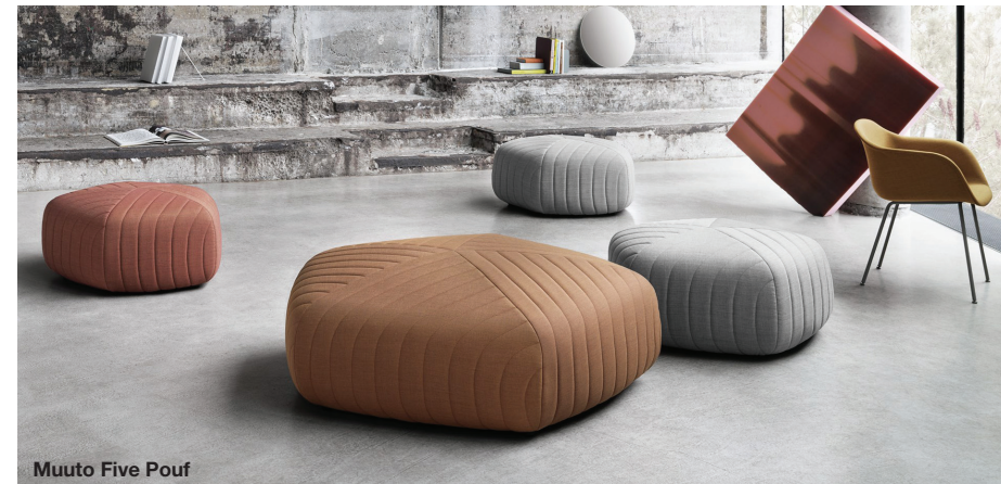
Muuto Five Pouf