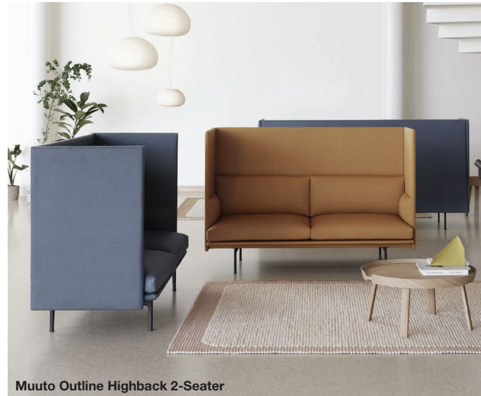
Muuto Outline Highback 2-Seater