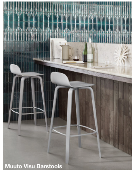
Muuto Visu Barstools