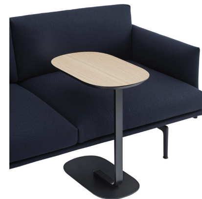
Muuto Relate Side Table