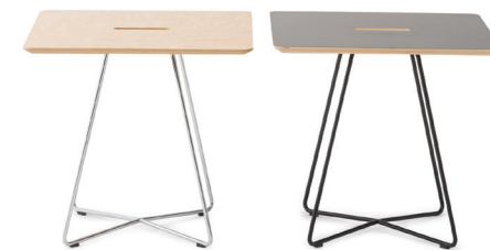
Rockwell Unscripted Side Tables