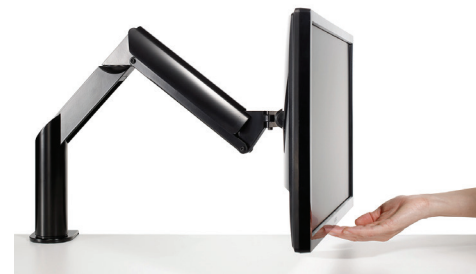
Knoll Extra | Sapper XYZ Single Monitor Arm