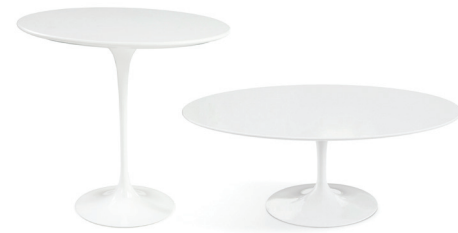
Saارين Side and Coffee Tables