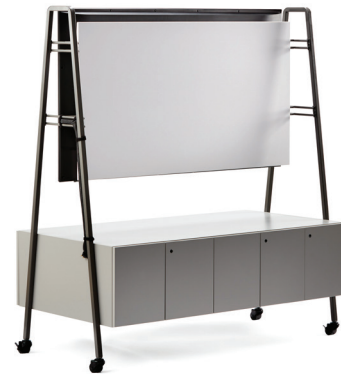
Rockwell Unscripted Media Cart