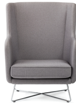
Rockwell Unscripted Highback Chair