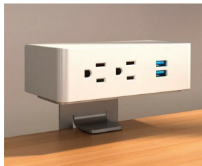
Reff | Desktop Power Module

At Knoll, our commitment to thoughtful design and quantitative research, coupled with leading edge technology, has resulted in a portfolio of ergonomic products, including task seating, adjustable work tables, technology support and lighting that helps ensure the well-being of your team. These ergonomic products form the building blocks of a workplace that facilitates productivity and comfort.