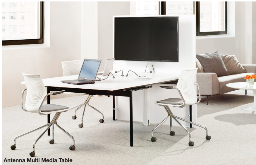
Antenna Multi Media Table

Collaborative Tables, Soft Seating and Screens