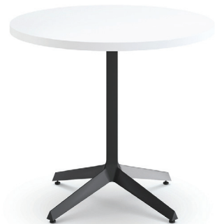
Dividends Horizon X-base Tables