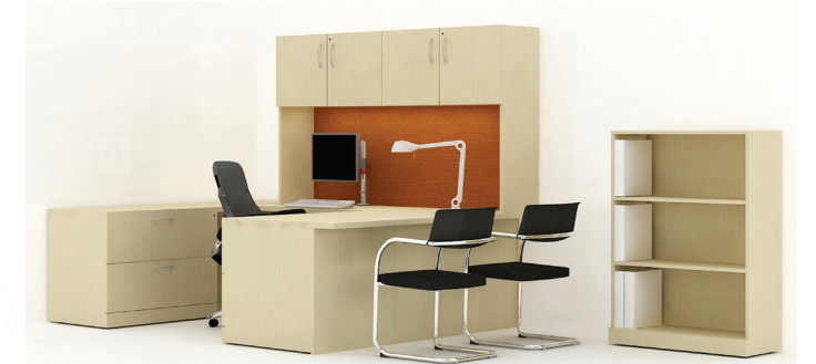
Reff Profiles | Freestanding