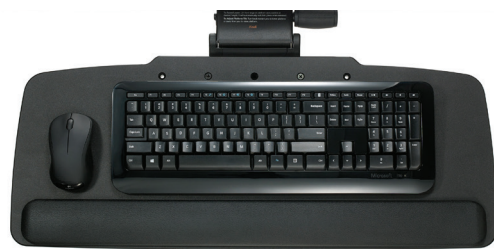
Knoll Extra | Keyboard Support Platform