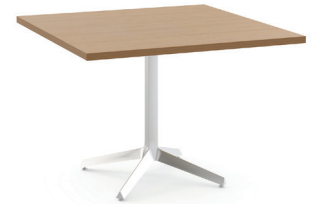
Dividends Horizon Meeting Tables