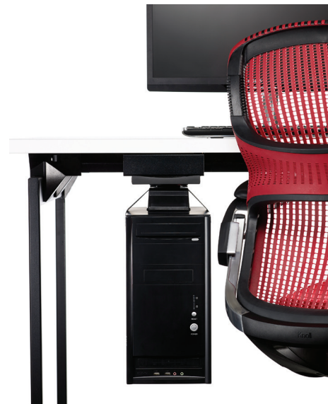
Knoll Extra | CPU Sling