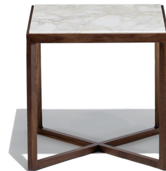
Marc Krusin Side Table