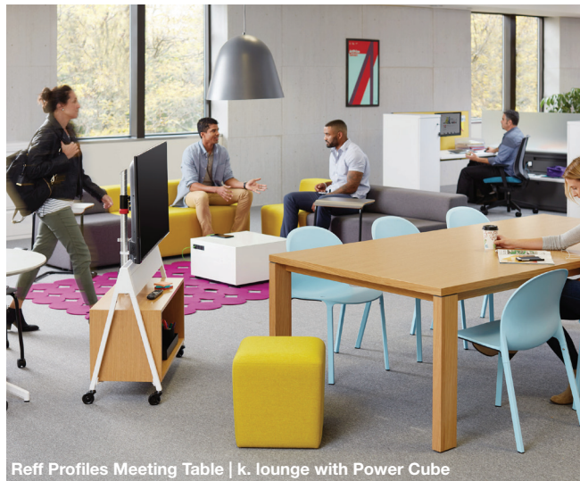
Reff Profiles Meeting Table | k. lounge with Power Cube